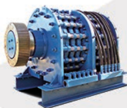
636 WCB Brake & Cradle