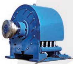
Brake & Cradle With Cover