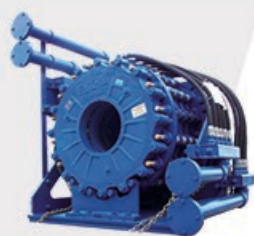
736 WCSB Brake & Cradle