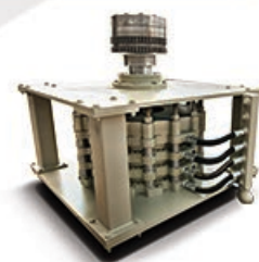
Top Drive Test Stands & Dynamometers

IN HOUSE MACHINE & MECHANIC SHOP 24-HOUR SALES & MECHANICS AVAILABLE LOCATED AT CORPORATE FACILITY